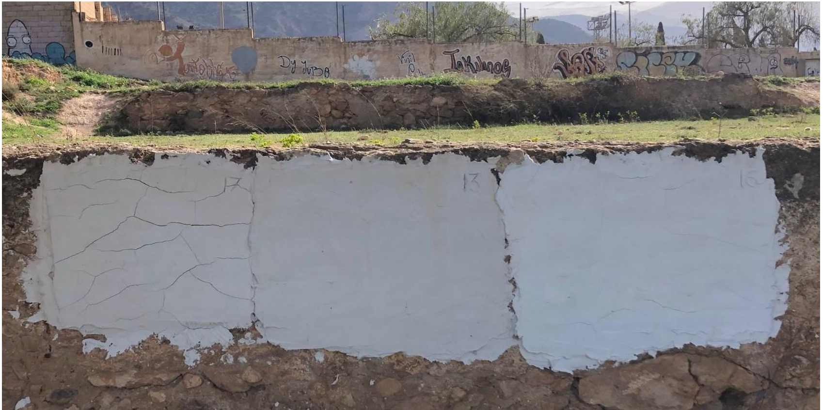
CONVENTIONAL HERITAGE MORTAR